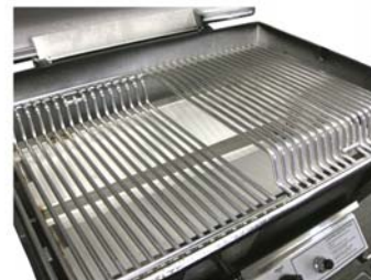
DPA119 (2 required)